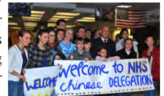
Greeting the Arriving Delegates

In early February, Newtown will welcome their fourth sister school visit from Liaocheng, China. The highly anticipated annual exchange between the two countries brings a tremendous opportunity for students, teachers, and families alike as they learn more about one another and their cultures. This year, Newtown welcomes forty Liaocheng delegates who will be guests of Reed Intermediate, Newtown Middle School, and Newtown High School. A visiting Liaocheng teacher will remain behind for an extended stay into late February to offer school-wide workshops to students and teachers in Mandarin; Chinese Art, Culture, History; and A Day in the Life of a Liaocheng Student.